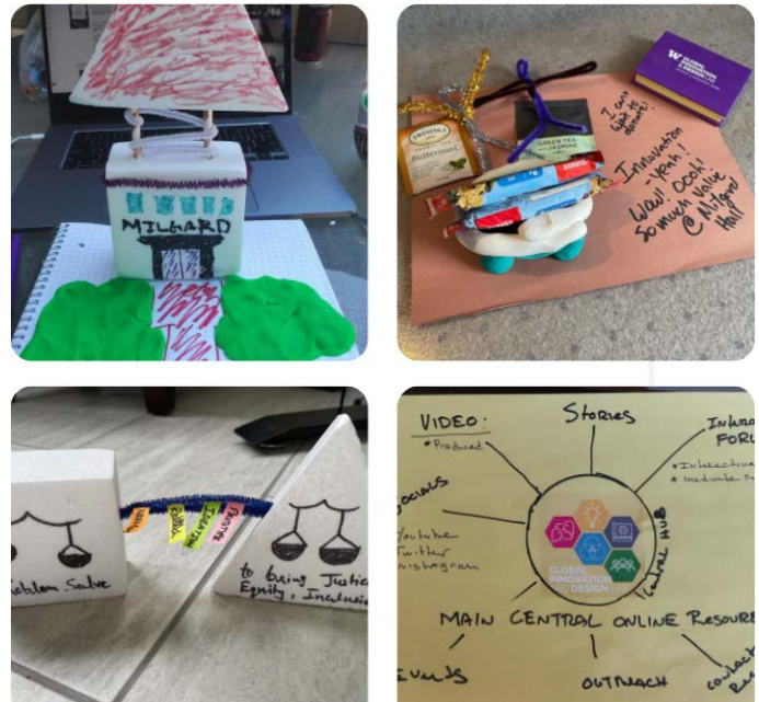
Pic. 3: A prototype of Milgard Hall as an inclusive and welcoming space for innovation and entrepreneurship.

students supported the CDT during the user research phase, which included interviews with key stakeholders, like university faculty, staff, and community members, to better understand their needs and challenges. Each team participated in a hands-on prototyping workshop using materials from their design kits (e.g., pipe cleaners, play-doh, colored paper and markers) to bring their ideas into the physical world.