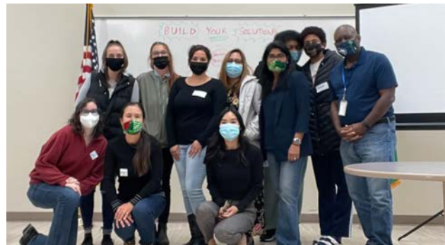
Pic. 5: Group picture from the last workshop!

The GID Lab team, in collaboration with United Way of Pierce County (UWPC) and Resilient Pierce County, facilitated two design thinking workshops with eight residents of the Salishan community in early September. These workshops helped wrap up a two-year project UWPC conducted to understand gaps and opportunities to accessing health and human services, especially during the pandemic.