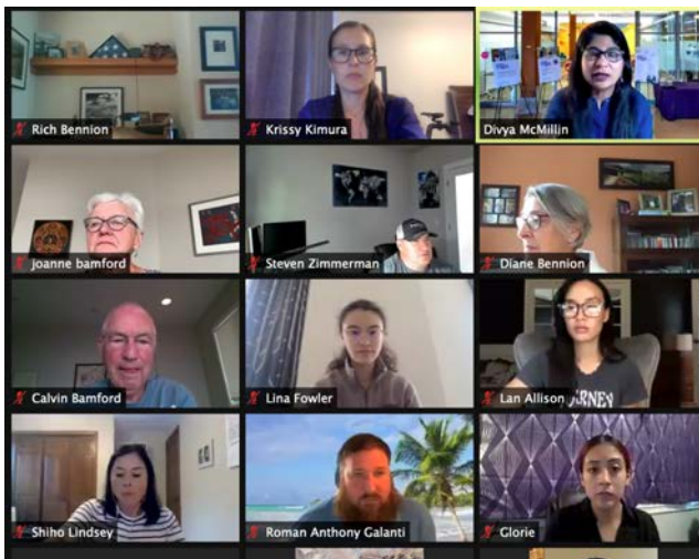
Pic. 2: CDT and students prepare for the July 31 workshop on empathy and ideation.

To launch the sprint, the CDT started with the need finding process. A significant amount of time was spent on the front end to identify the right problem to solve. The MBA