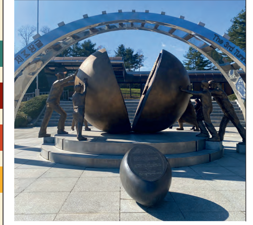
Reunification Statue @ 3rd Tunnel