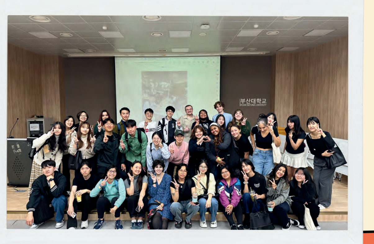
UWT & PNU Students!