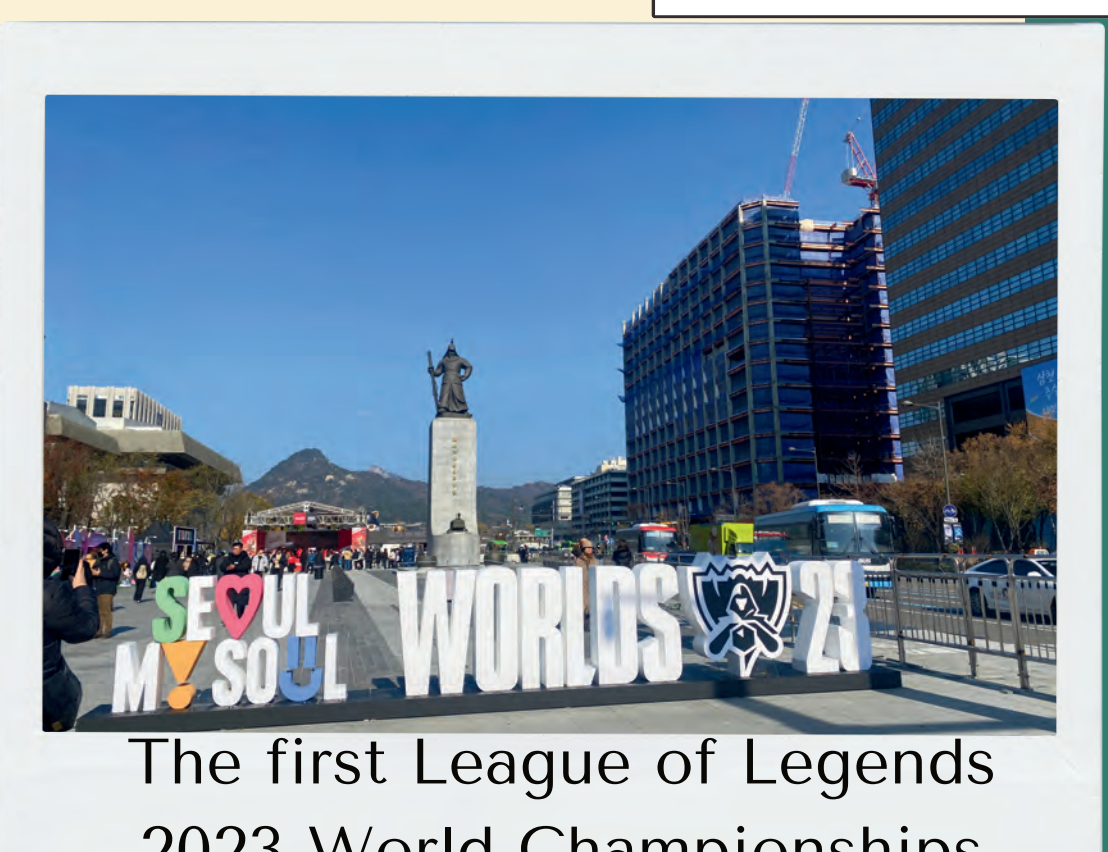
2023 World Championships