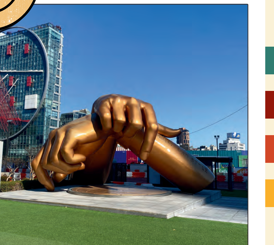
The Gangnam Statue