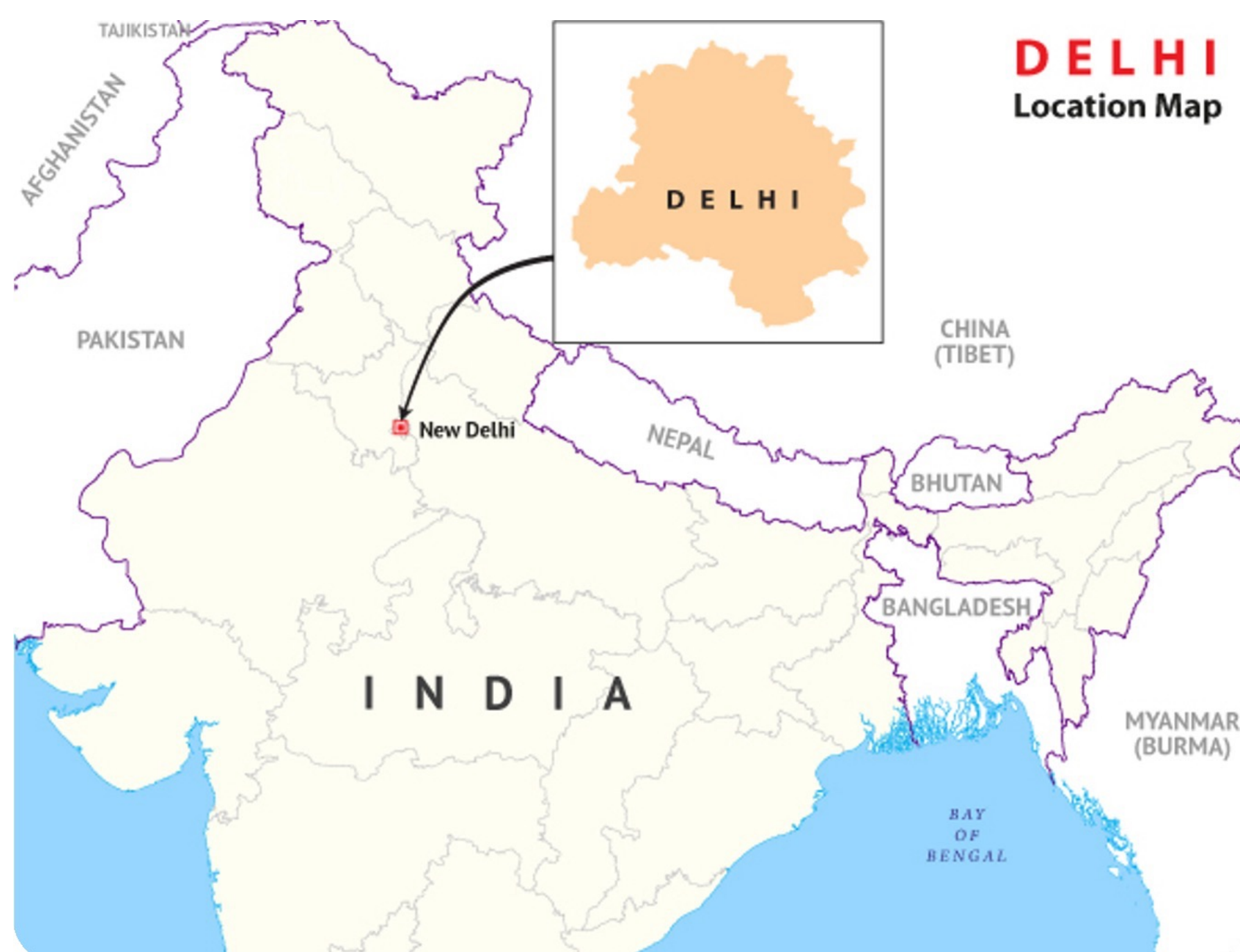
Fig 1. Map of India with capital, New Delhi, and national capital territory, Delhi.