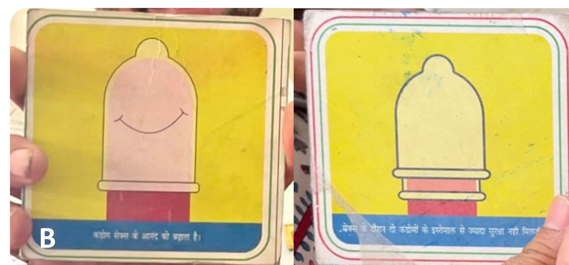
Fig 3. HIV/AIDS Interventions take Place at Truckers' Workplace. (A) SPYM employees carry out an engaging theatrical play that opens dialogue around safer-sex and models condom purchase. (B) Card game debunks double-condom myth with color-coding that relates to truckers' profession (red and green correspond to stop and go).