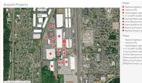
Figure 3: The final heatmap displaying ongoing projects at the Auburn Facility.