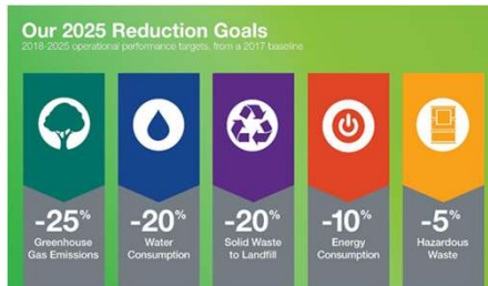
Figure 1: The conservation goals Boeing intends to reach by 2025